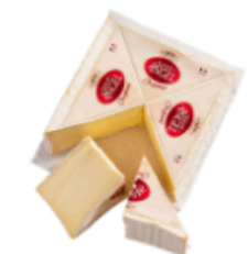
BELGIOIOSO MOZZARELLA 1LB SLICED 8.99 EACH

Join us Every Saturday Between 3pm-6pm for a Free Wine Tasting!